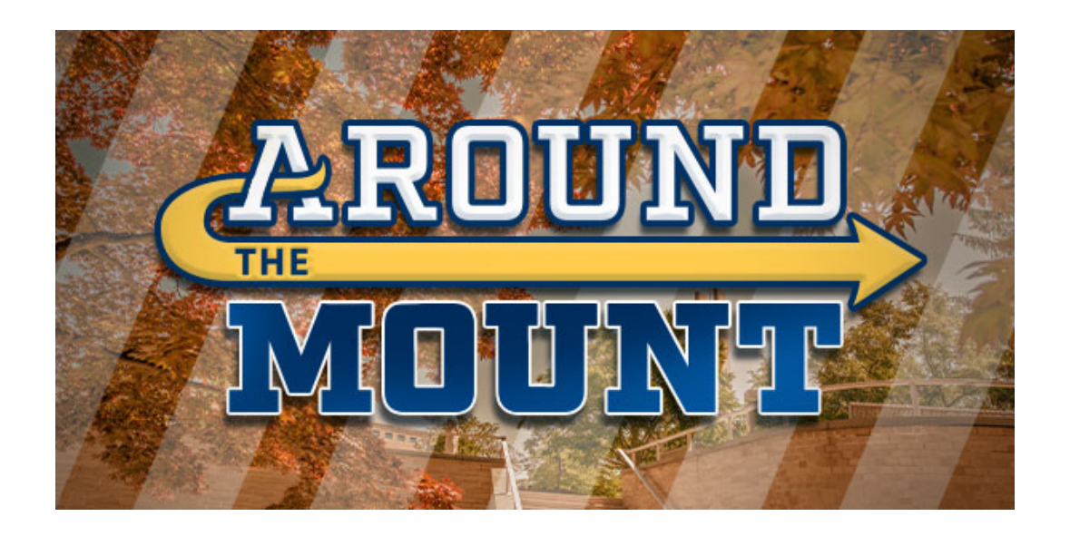
Around the Mount November Edition

Subject: Around the Mount Newsletter November Edition